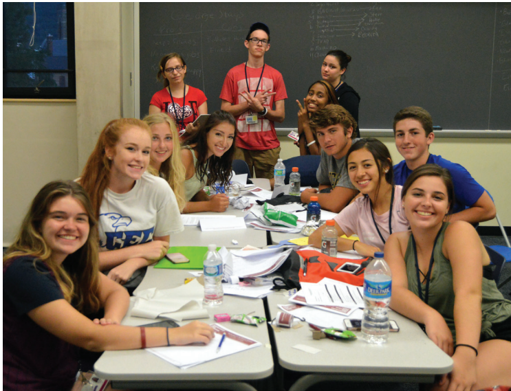
Here a 2016 student company takes a much needed break from preparing their advertising and stockholders presentations.

There is an award-winning summer program that for nearly four decades has been exciting the imaginations of high school students throughout Pennsylvania about the world of business and private enterprise. That program, Pennsylvania Free Enterprise Week (PFEW) , will be celebrating its 39th storied year this July and August.